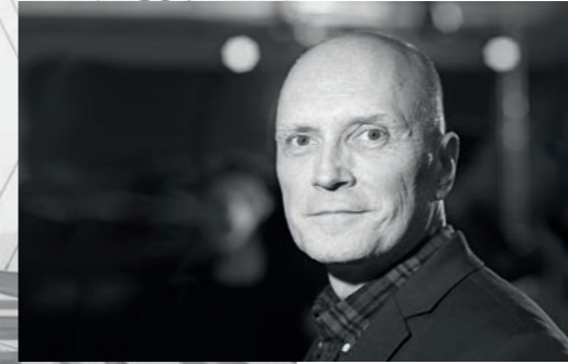
Georg Luksch Music Production